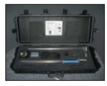
Rugged case provided with optional top-setting rod