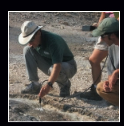
Spot Current Sampling