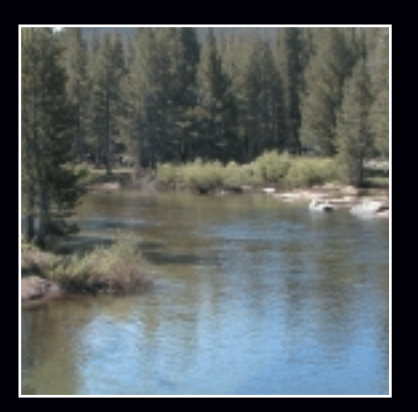
River Discharge and Flow