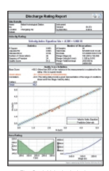
FlowPack Velocity Indexing report software