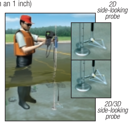
Example of typical stance and technique when using the FlowTracker